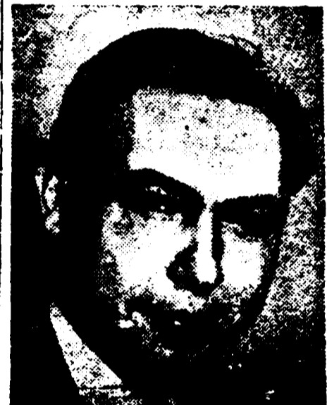
Bobby Sand Strikes Back